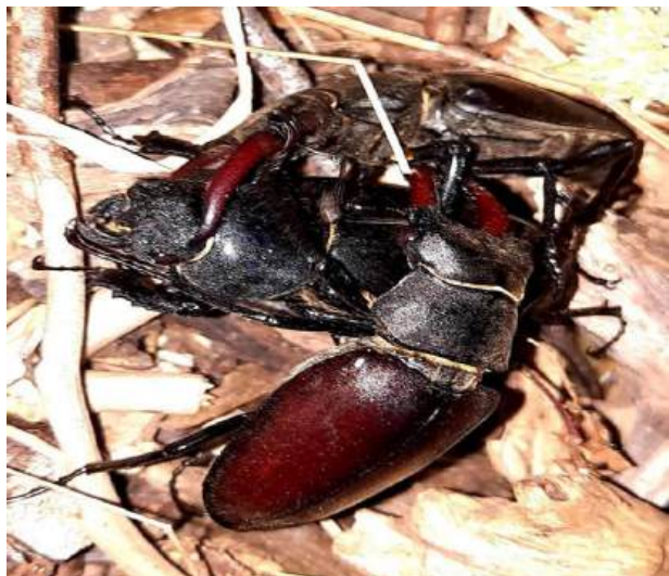
Stag Beetles at Northfield June 2025