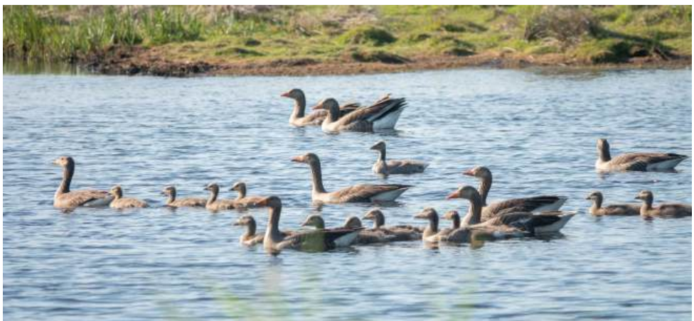
Plenty of Greylag geese with young on Rockford

Lots of the more common species used the nesting boxes erected around the lakes, plenty of Blue tits and Great tits, along with Robins and Dunnocks. Several Blackbirds and Song Thrush nests were observed in the dense bramble areas, along with some migratory nesting visitors such as Chiff Chaff and Whitethroats.